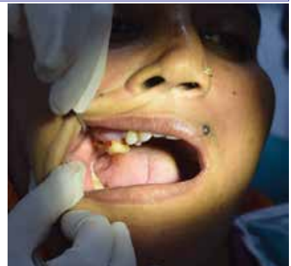
Above: Broken teeth with pyorrhoea. Below: Fully restored set of teeth.